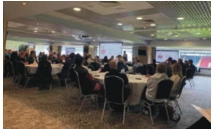
Cyber Crime Conference.

Guest speakers discussed the current cyber-threat landscape and provided businesses with information to improve cyber-security.