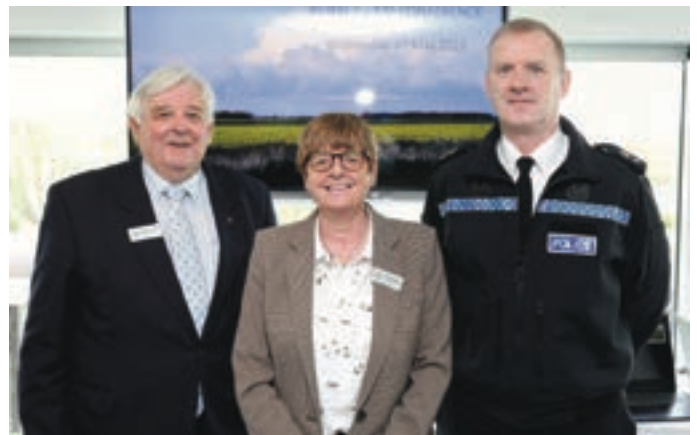
South Division Rural Crime Conference Hurlston Hall, May 2022.