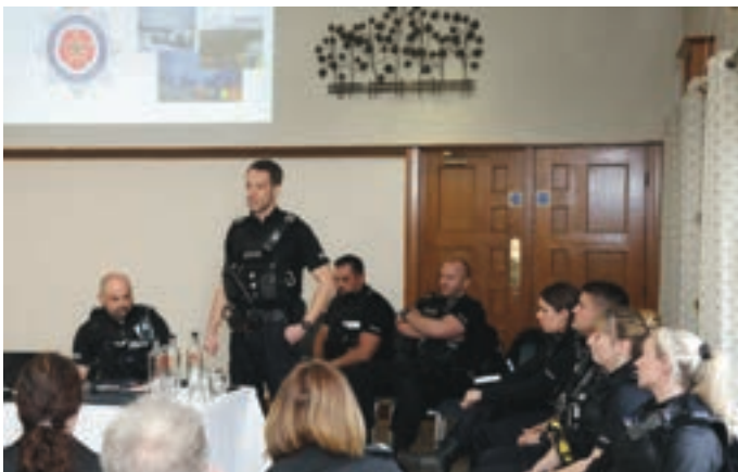
West Division Rural Crime Conference Lancaster House Hotel, February 2022.