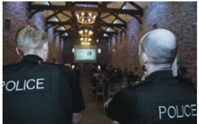
Ribble Valley Rural Crime Conference Browsholme Hall, February 2022.

There was a number of presentations at each conference, which will be relevant to current threats; alongside the latest partnership initiatives to prevent and reduce crime. Working with rural communities is key to tackling and reducing crime and keeping rural Lancashire a safe place to live.