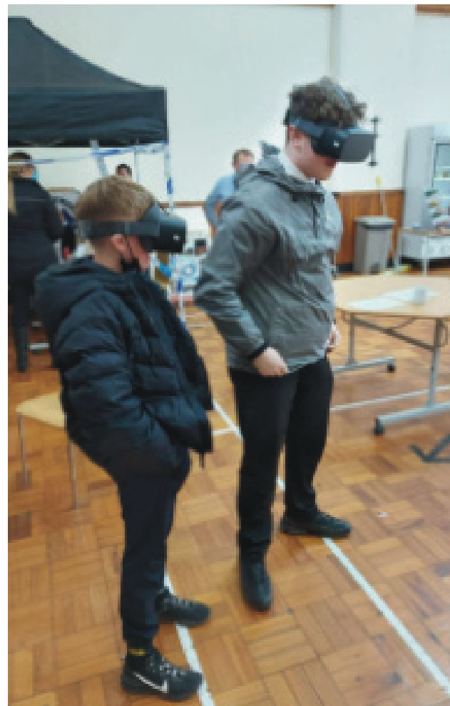
The virtual reality headsets.