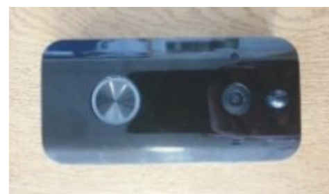
An example of a video door bell.

I was successful in gaining funding for the ring doorbells at Chorley and they have been a huge success so far and we have managed to locate and gain evidence of who these females are.