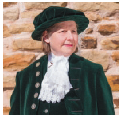
The High Sheriff of Lancashire 2020-2021.